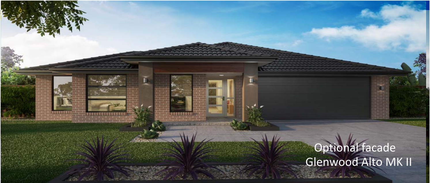
Optional facade Glenwood Alto MK II

Arcadia 23 Lot 517 Cnr Springfield Drive & Herdsmen Road Lochinvar. Land valued at $348,000